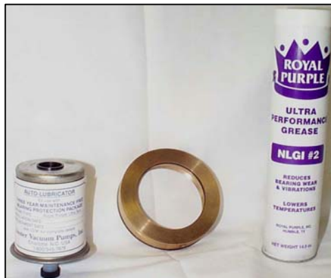
Automatic Lubricator, Bearing Isolator, Synthetic Lubricant