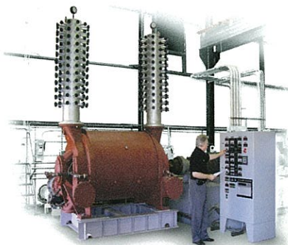
A Vooner FloGard two inlet cone port pump tested in the Charlotte, NC, test facility